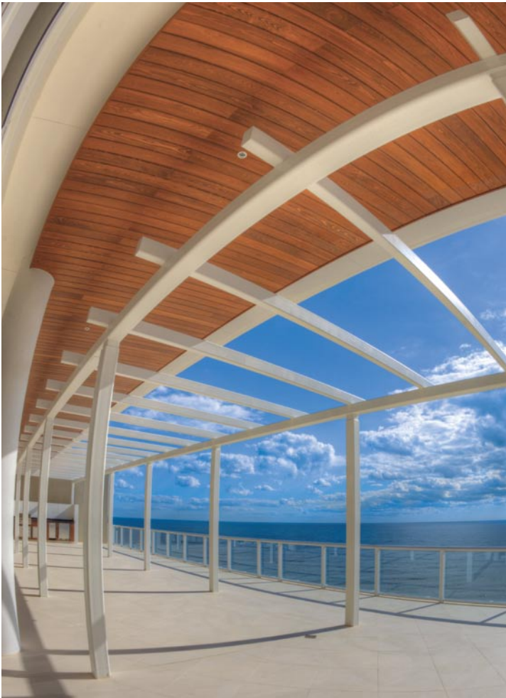
▲ Penthouse 3