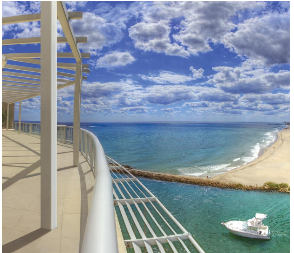
Penthouse 1 ▲