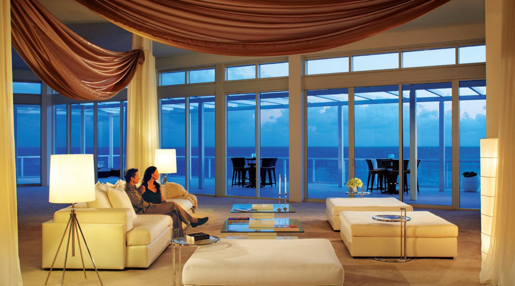
Penthouse 2 is one of four recently released penthouses from the exclusive Penthouse Collection. ▲